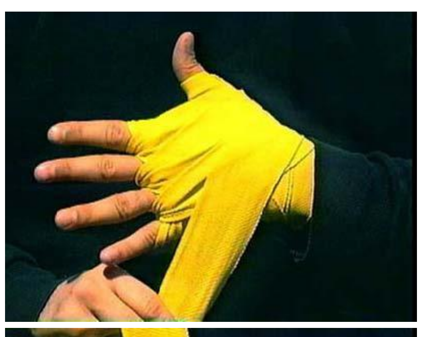
Now wrap around the knuckles again.