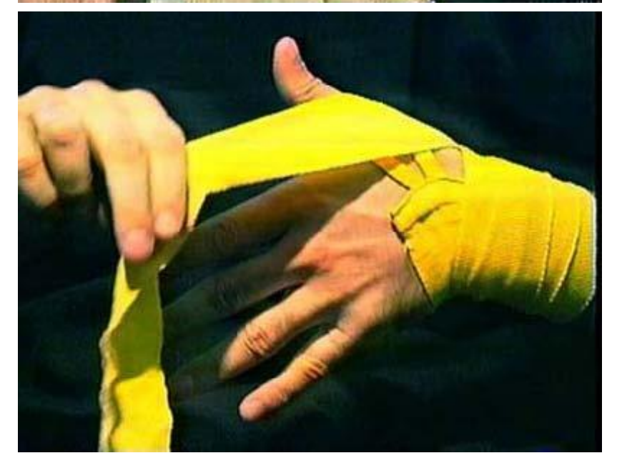
Bring the wrap over the top of the thumb.