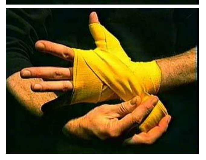
Bring back around the wrist