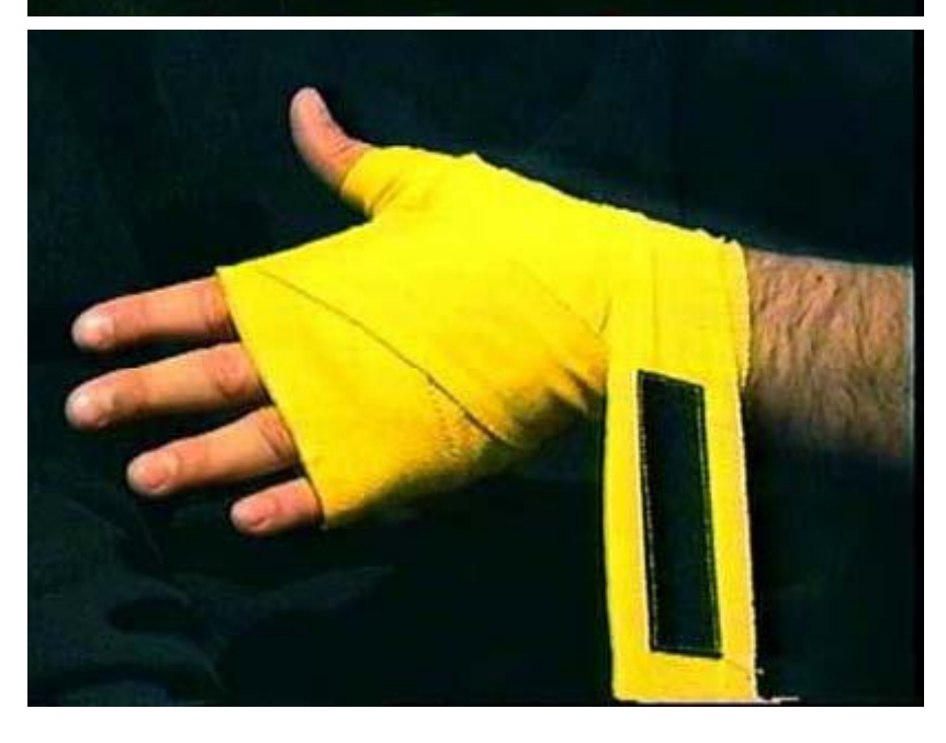
Now secure the Velcro and you are ready.