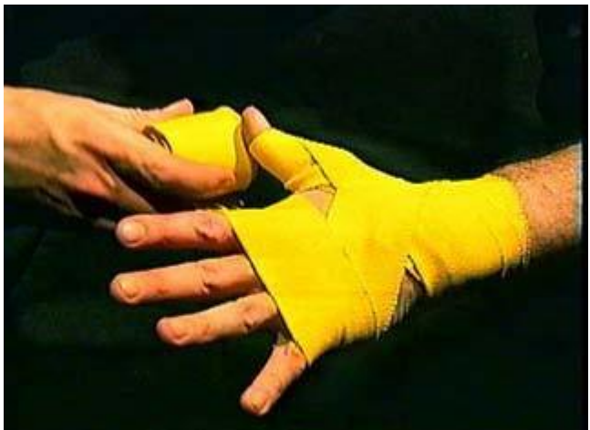
Wrap around the knuckles 3 times.