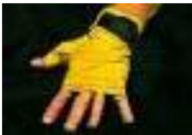
Ready for action!