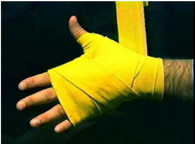
Bringing around the wrist.