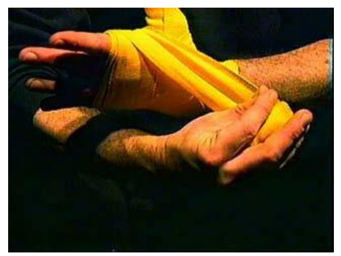
Bring back around your wrist and secure Velcro attachment.